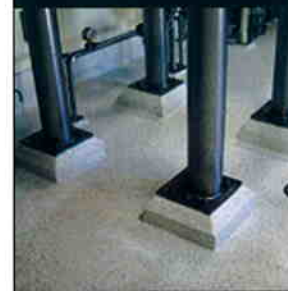
DECORATIVE MOSAIC COATING SYSTEM